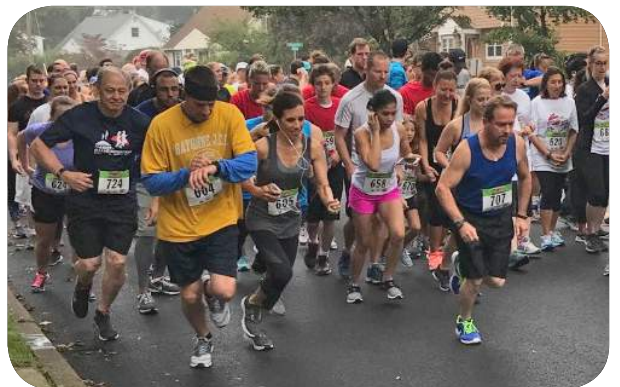
Runners begin the Apple Chase Spa 23 5K/12K on Sunday, October 15.