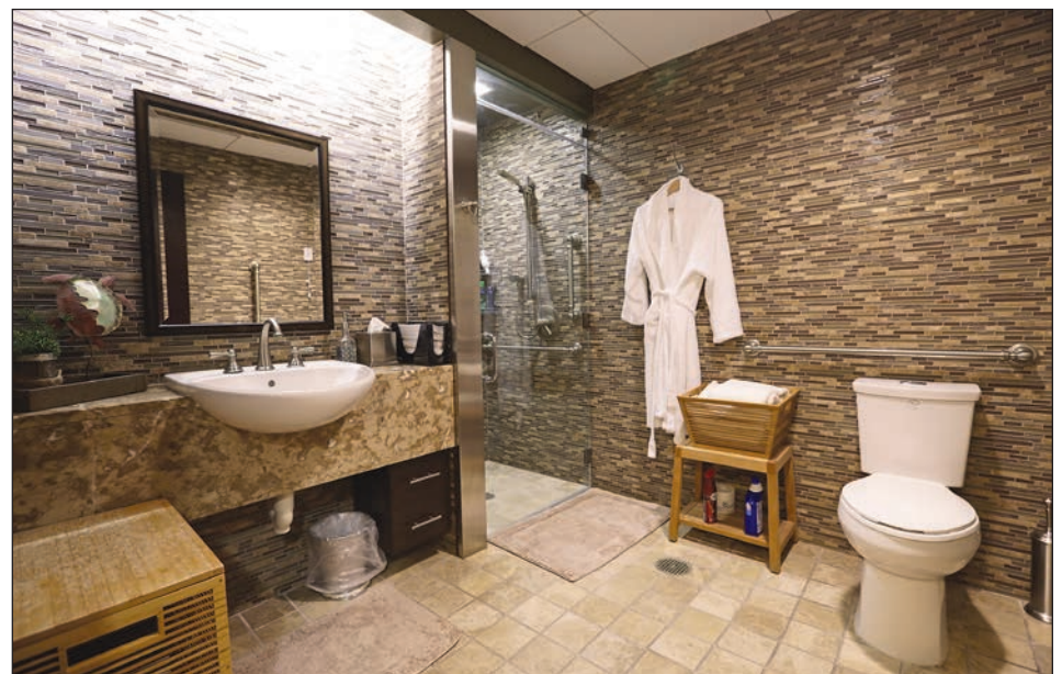
Atlantic Health's executive health center in Morristown has a spa-like quality.