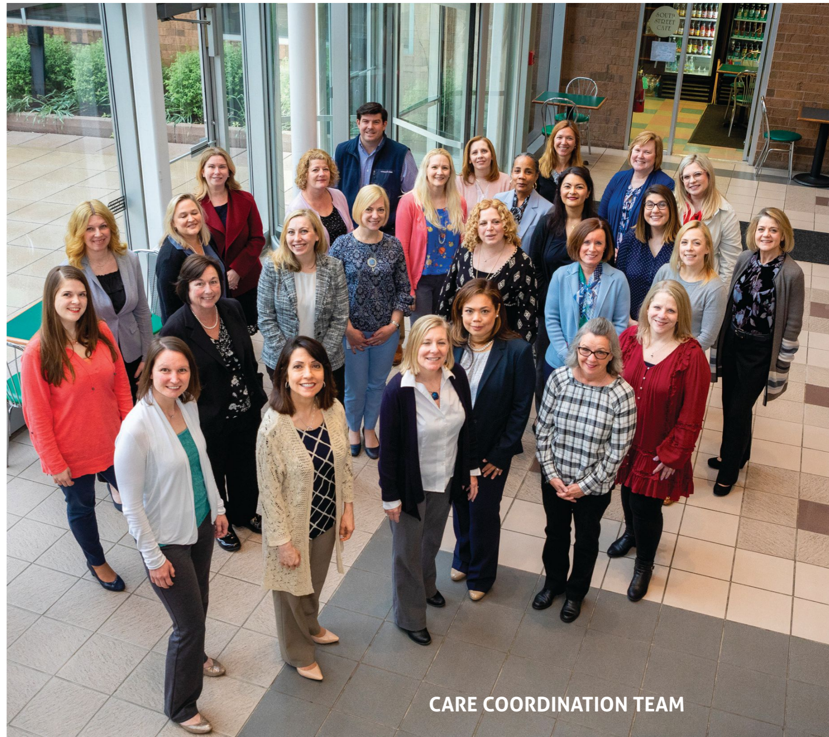
CARE COORDINATION TEAM

patients and their families understand what the next steps are in terms of follow-up with their doctor, ensuring patients have the necessary medications and develop confidence to take care of themselves at home. It's great to watch patients safely make the transition and ensure they are on the best track to reach their health goals." ▲