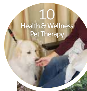
10 Health & Wellness Pet Therapy