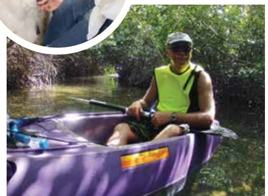
6 Moments That Matter: A Team Approach to Cardiac Care