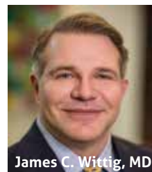
Internationally recognized orthopedic oncologist

When diagnosed with a bone tumor or bone cancer, some patients may not understand all of their options when determining which medical professional they should contact first.