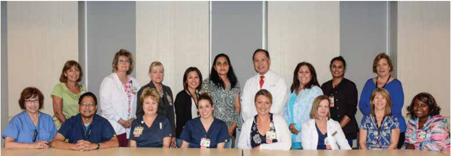
The ERAS multidisciplinary team includes physicians and surgeons; nurses with specialties in pre-admission testing, ostomy care, perioperative, operating room, recovery room, inpatient, data analysis and case management; anesthesia team; physical therapists; nutritionists; pharmacists; and the Overlook administration team.

ERAS. Not all places use ERAS; those that do, generally use only parts of it. We use it comprehensively. The commitment by our teams – from before admission to after discharge – truly enhances surgery and is second to none.”